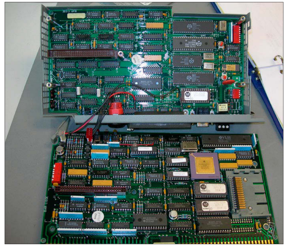
Repaired component from Paragon.