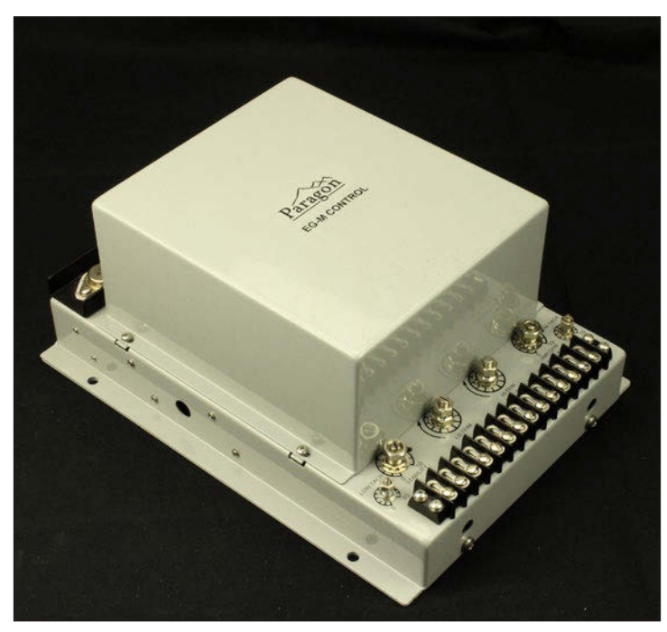
Paragon OEM electronic governor module