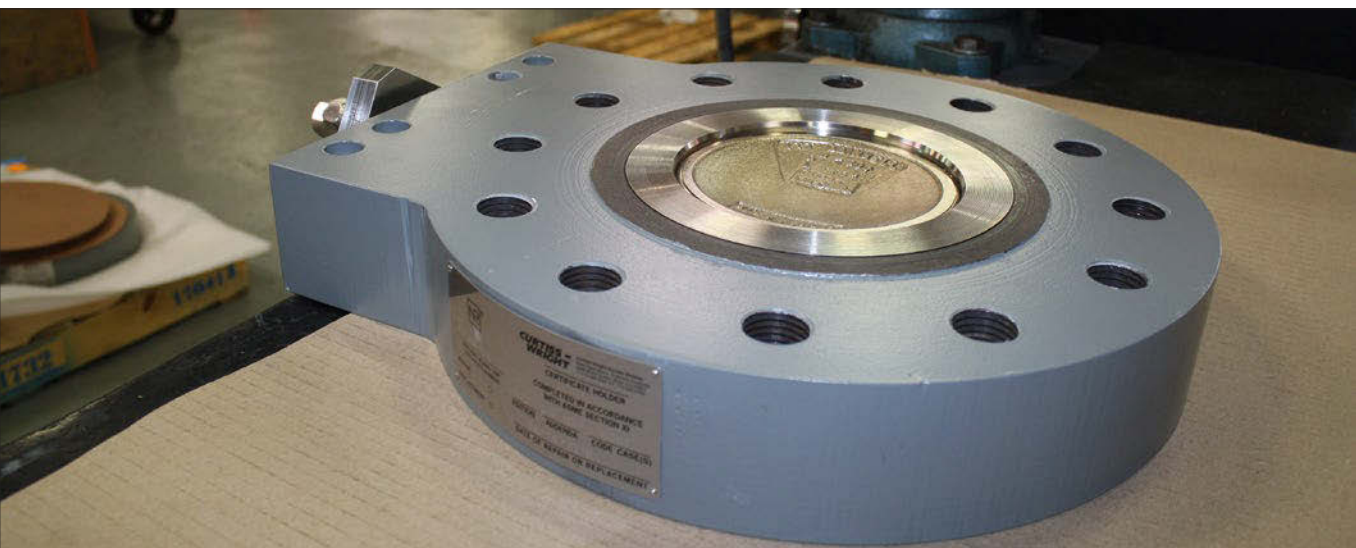
Top left: As found body. Top right: As found valve disc. Bottom: Finished valve body and disc.